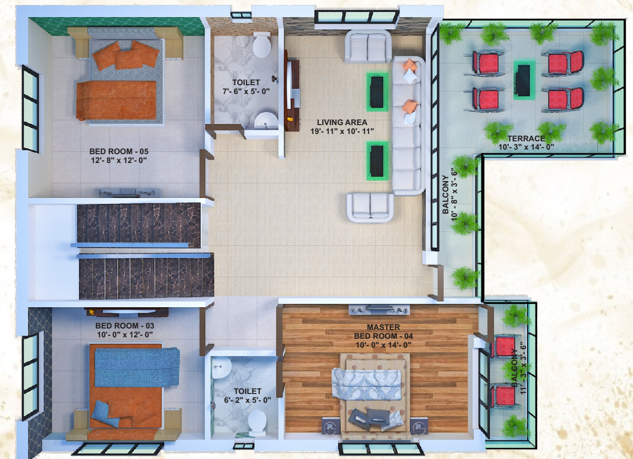
Lower Level Plan