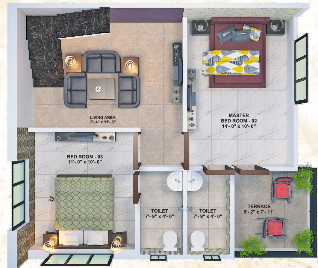
Lower Level Plan