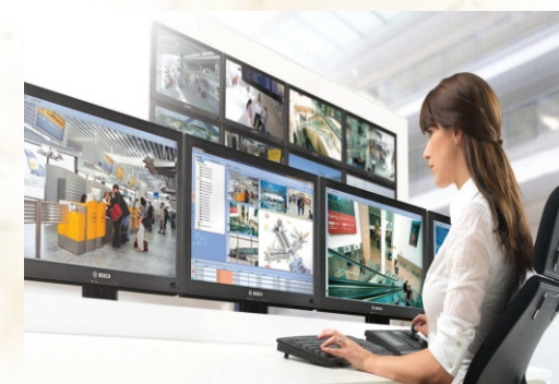
SAFETY & SECURITY

Welcome to Metro City, your home amid unparalleled luxuries and lush green settings. Your abode of luxuries has earmarked upto 50% open area for green manicured landscape plus a vivid assortment of leisure features.