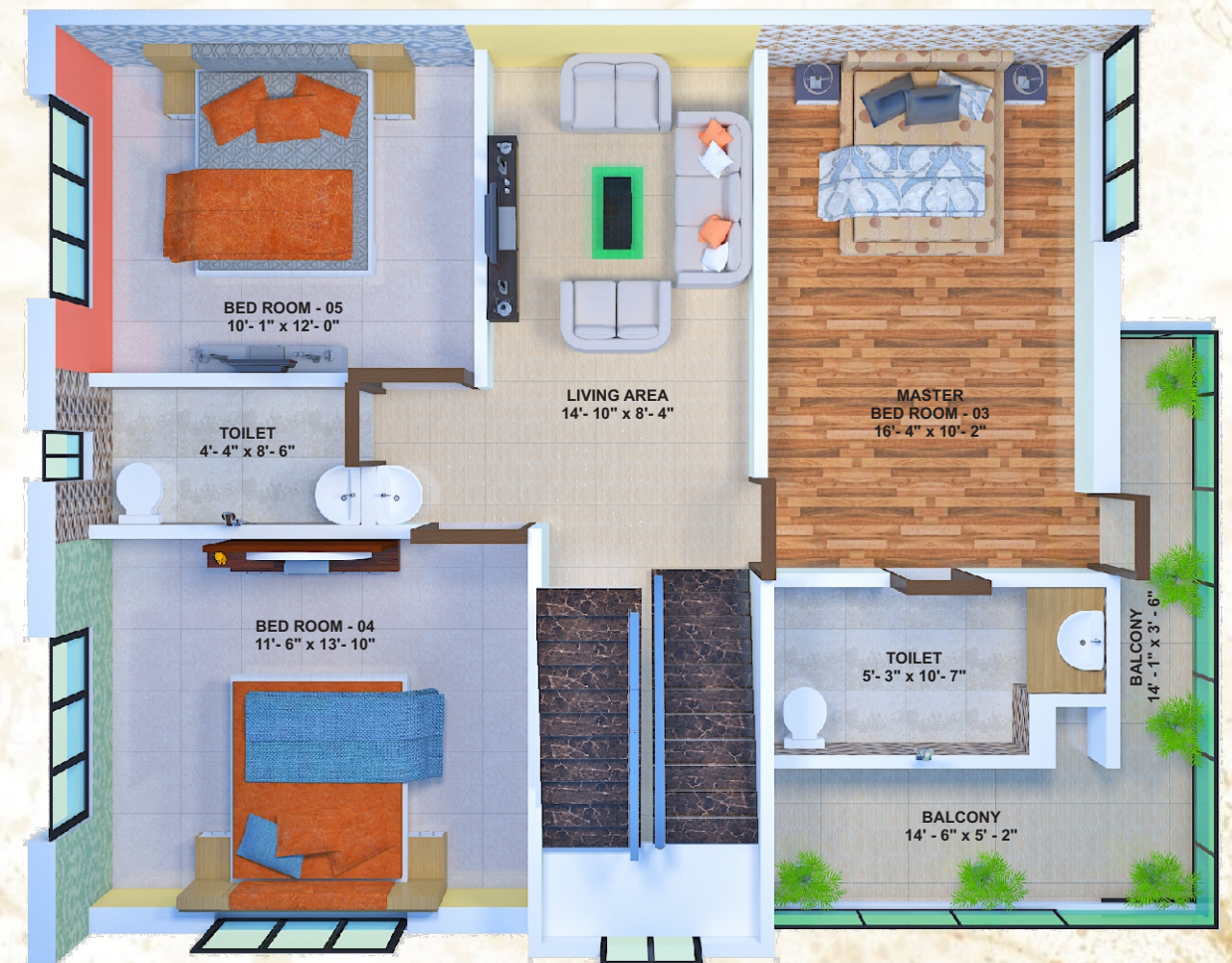
Lower Level Plan